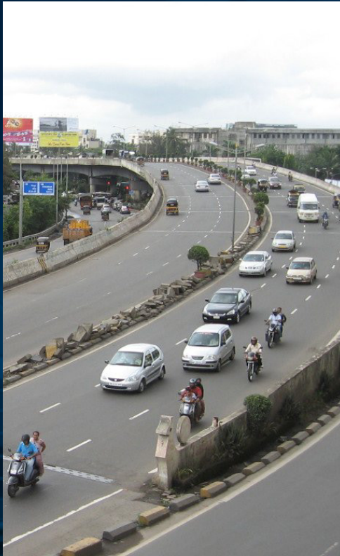
*Kandivali express highway