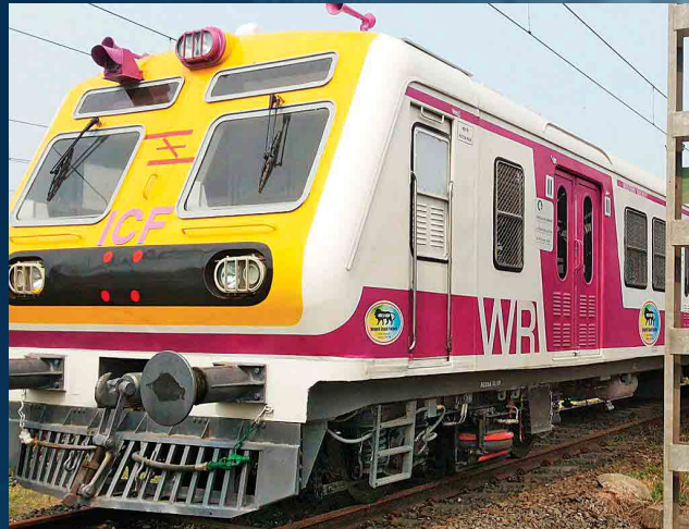
*Kandivali railway station